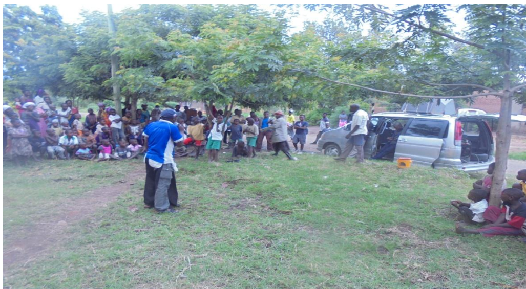
Road show on prevention and control of malaria in Munknyu and Kisinga S/counties