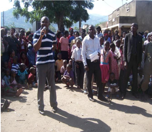
GHFRD project officer