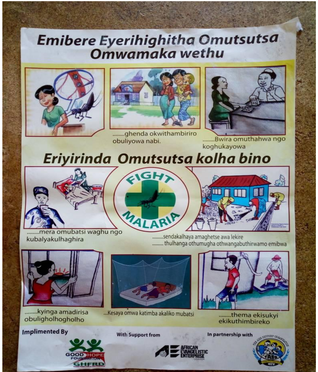
Malaria poster in Ihukonzo